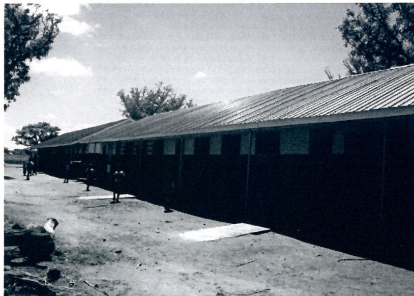
Permanent new classrooms, but no water provision