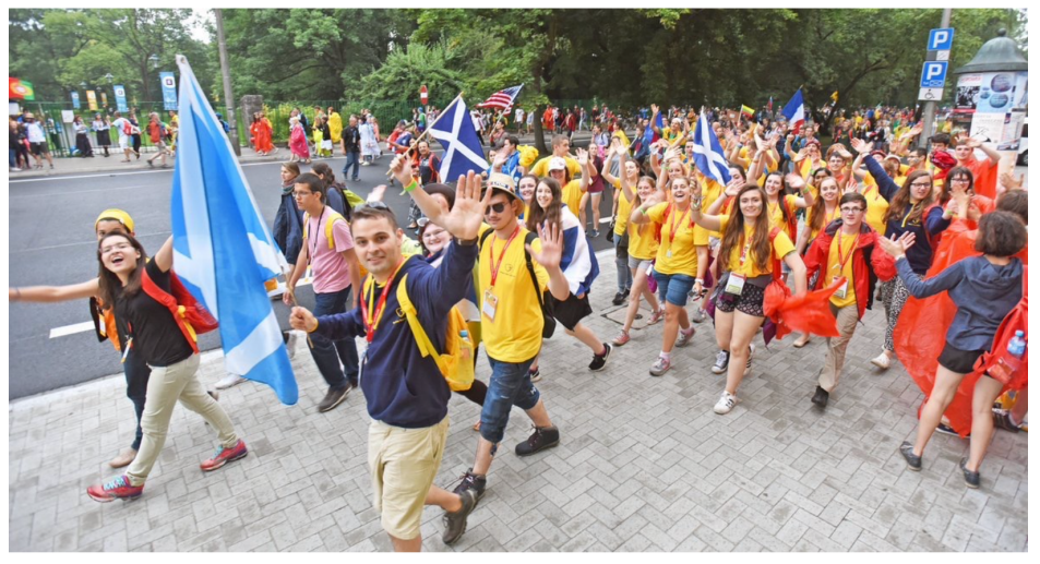
Dunkeld Youth attending World Youth Day - Photo courtesy of Paul McSherry